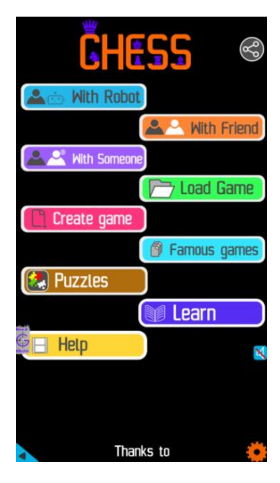
Figure 2: Play chess online for free. Solve puzzles and play with friends

Play chess for free at https://gbud.in/chs